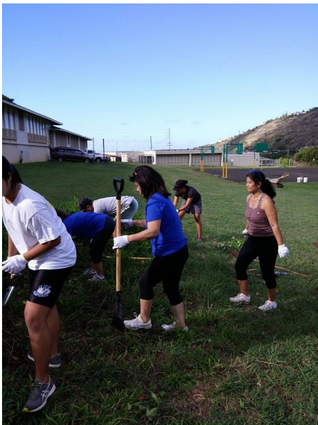
Down & Dirty